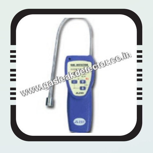
Portable Industrial Gas Detector