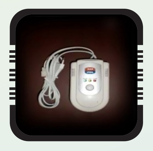
LPG Gas Detector