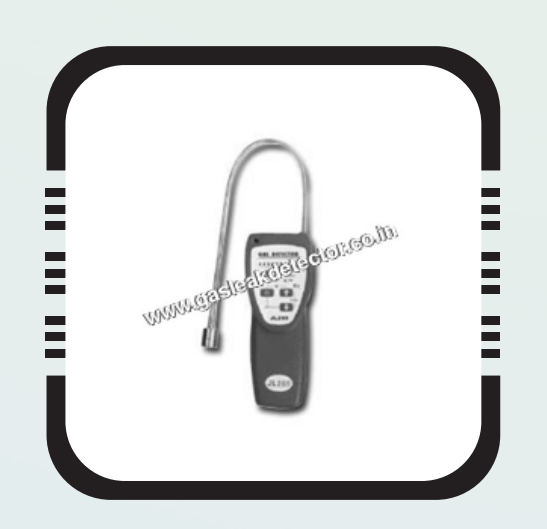
Portable CNG Gas Detector